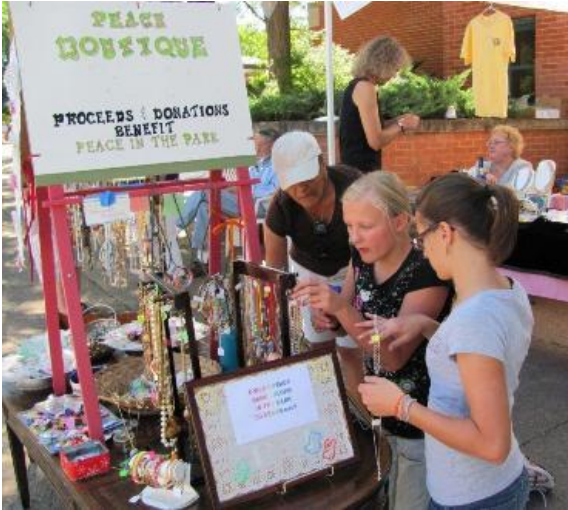
Shoppers at the Peace Boutique

Light of Christ members contributed new and used jewelry to the popular Peace Boutique jewelry sale. Proceeds from this sale raise funds that help with expenses needed to put on the Peace in the Park Festival.